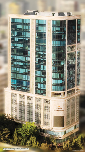
Supreme Headquarters, Bandra W