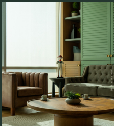
Supreme Headquarters Lounge, Bandara W

For Supreme, a redevelopment project is an opportunity to elevate the lifestyle of our customers and the neighbourhood.