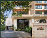
Supreme Arteeda, Bandra W

Our efforts towards environmental responsibility begin with these methods, and go further in new ways with every project.