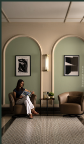
Supreme Village Lobby, Pune

At Supreme, we believe it's not about the biggest, tallest or most expensive building,